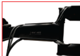
U-Groove covers provide 1" clearance for cables