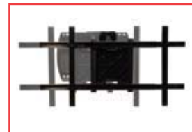
10.75" of horizontal adjustment